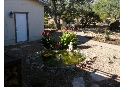
The fish pond